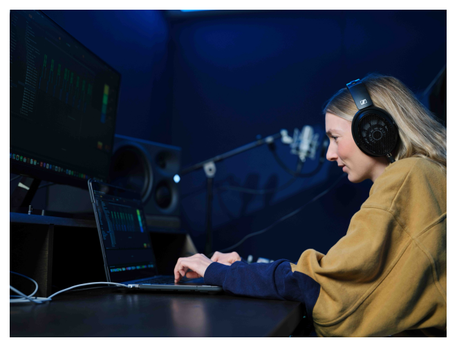
The type of ear pad has a massive impact on sound reproduction – with the HD 490 PRO, users get two headphones in one. With the producing ear pads reproduction is slightly warmer, while the mixing ear pads help to drill down on the individual frequencies

The producing ear pads (velour) of the HD 490 PRO have a slightly warmer response to create perspective and help users make a holistic judgement of the sound. The mixing ear pads (fabric), on the other hand, allow for a very flat, neutral sound that helps dive into detail when a sound reference is needed in finishing off a mix. Both ear pads are washable – a solution that is both hygienic and sustainable.